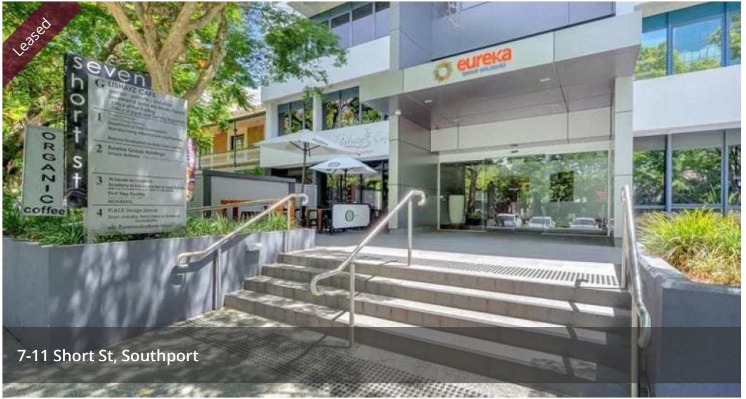
7-11 Short St, Southport