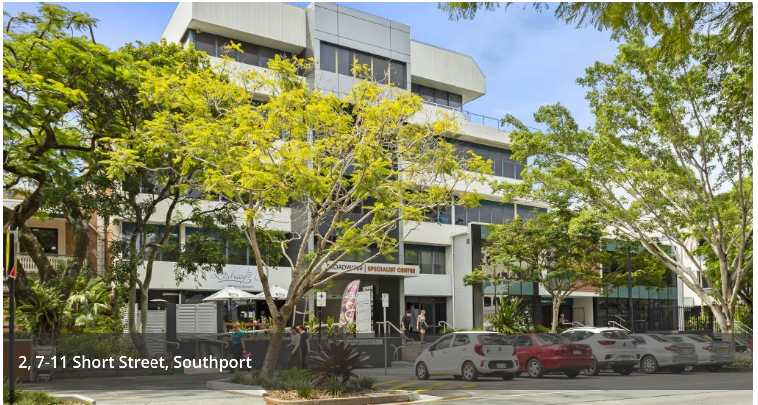
2, 7-11 Short Street, Southport